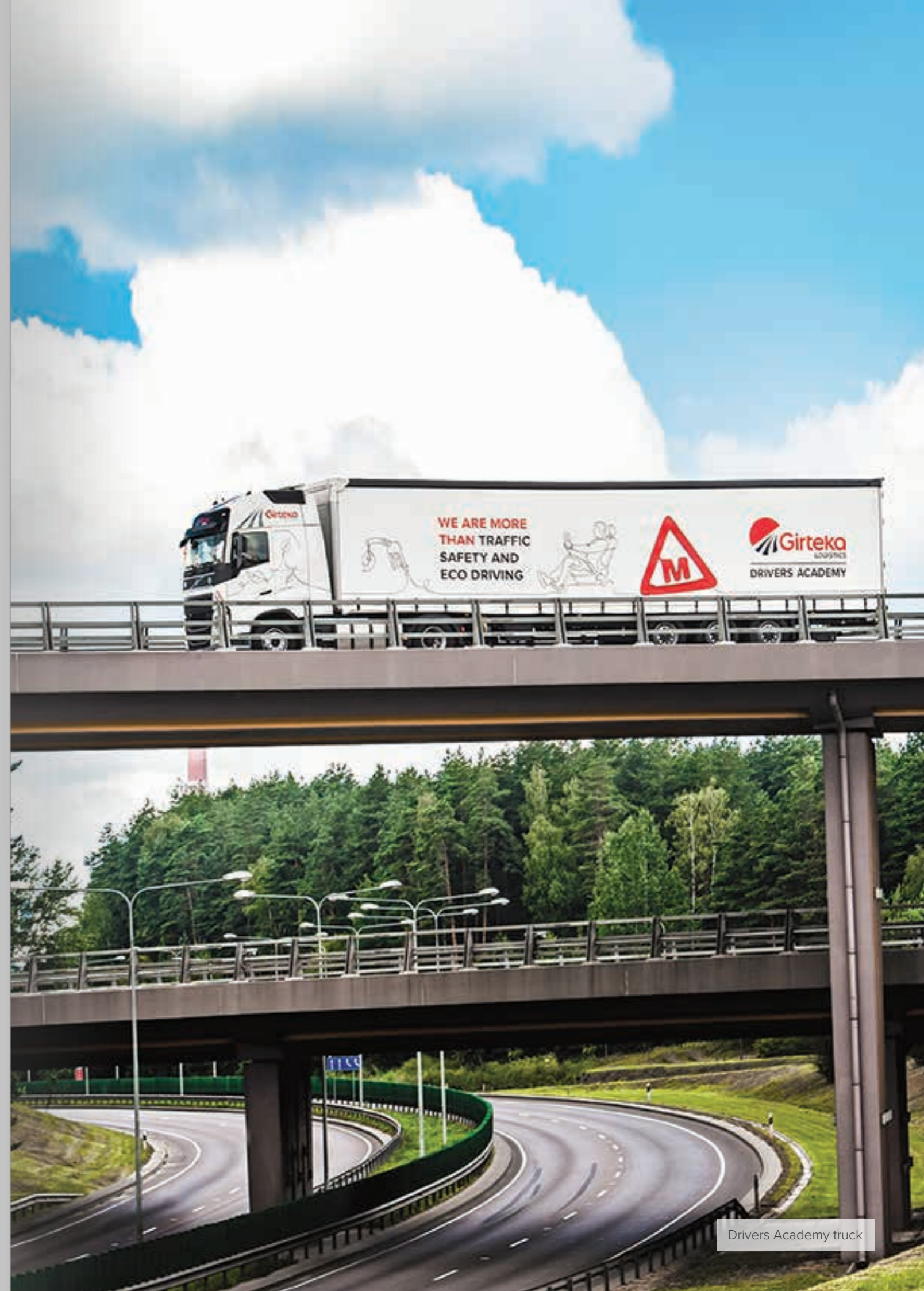
Drivers Academy truck

Depending on the economic indicator collected, participants fell into a relevant category: bronze, silver, gold or platinum. Each of the drivers had the opportunity to rise from a lower qualification group to a higher one and vice versa.