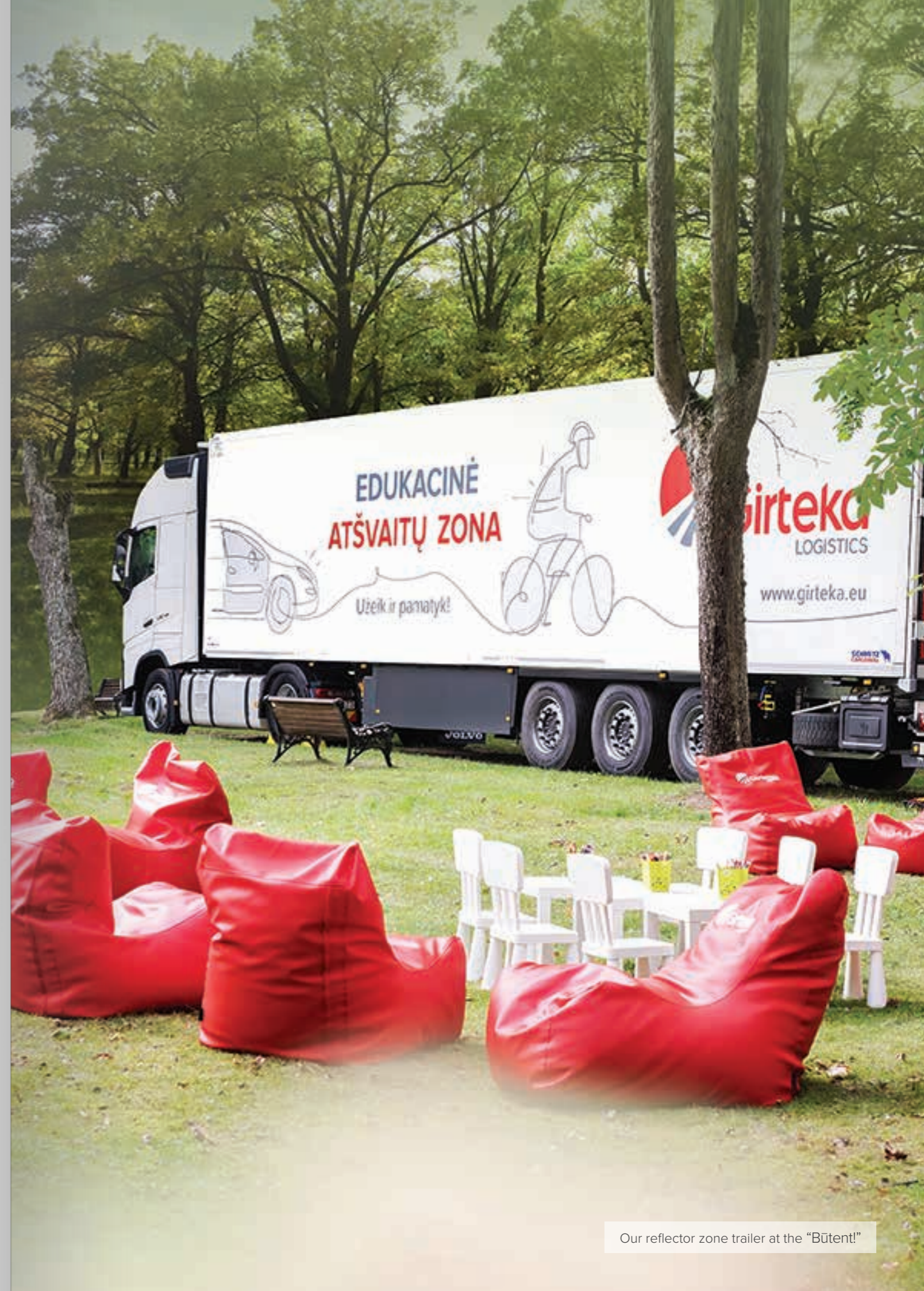
Our reflector zone trailer at the “Būtent!”

Vision Zero for road safety originated as a concept in Sweden in 1995, to focus on the prevention of accidents so that no-one should die or be seriously injured in traffic. It is now an initiative that has taken off in many countries around the world.