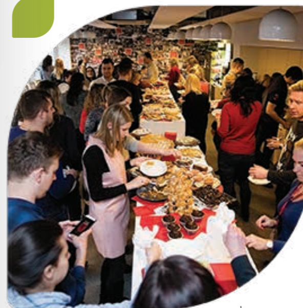
CAKE DAY / "Mamų unija" charity