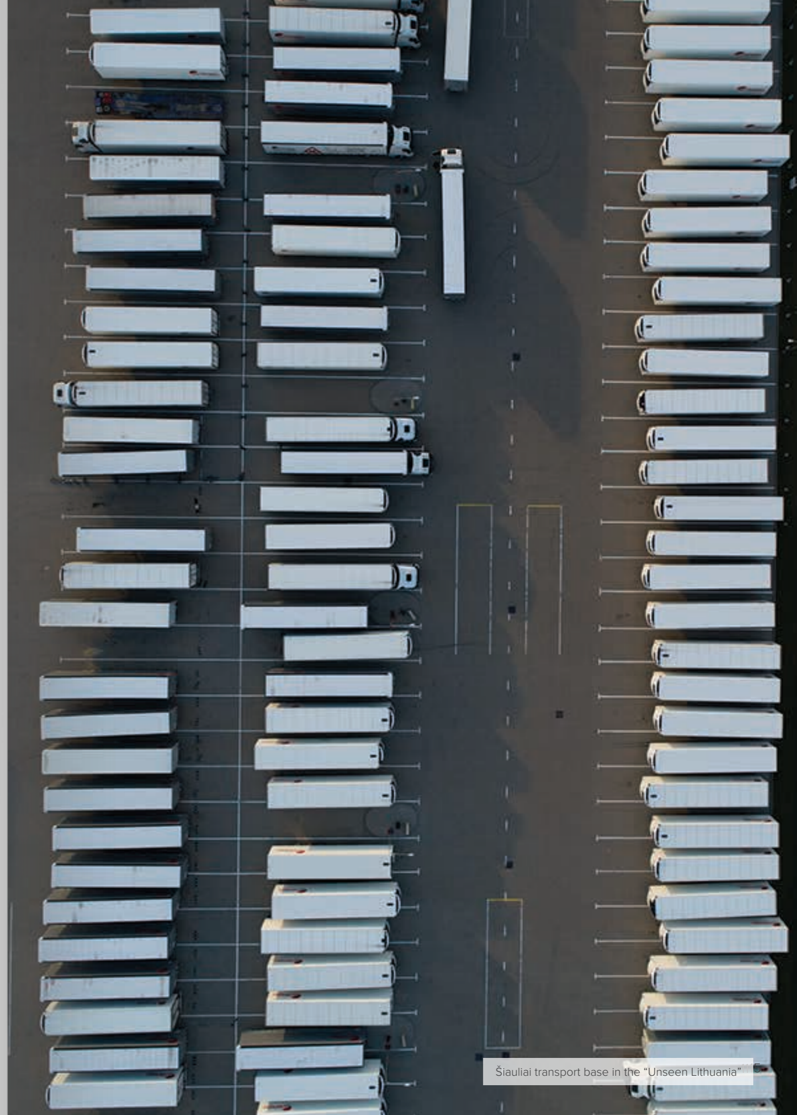
Šiauliai transport base in the “Unseen Lithuania”