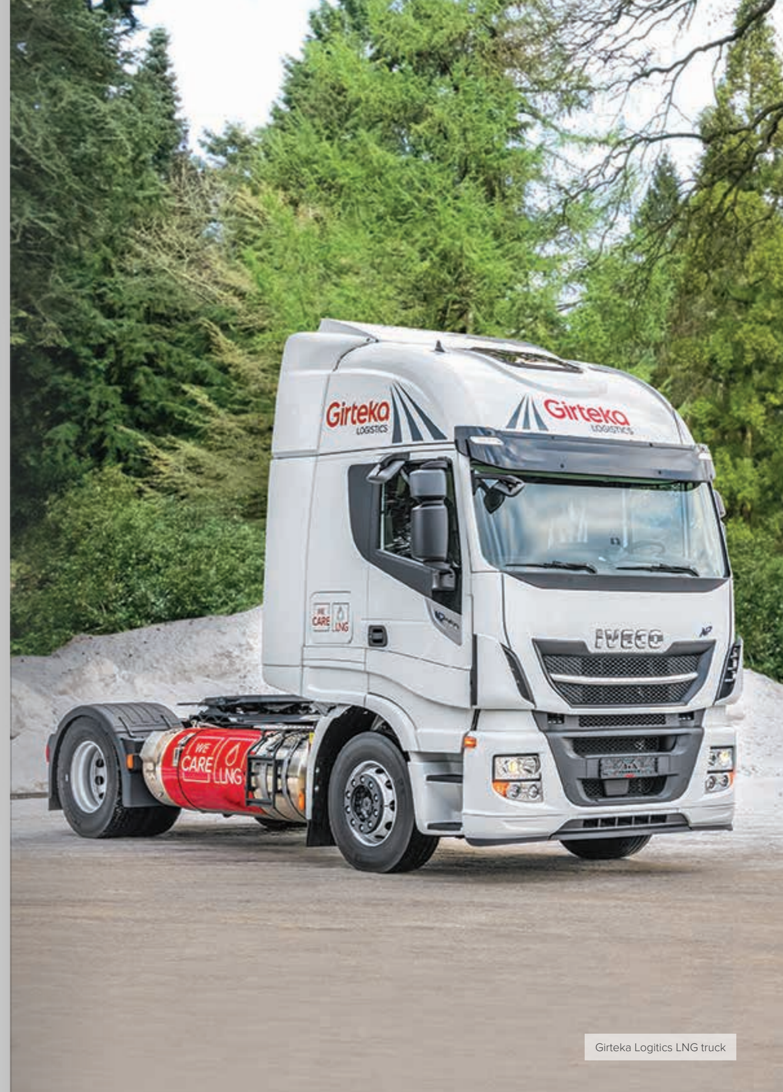
Girtėka Logistics LNG truck